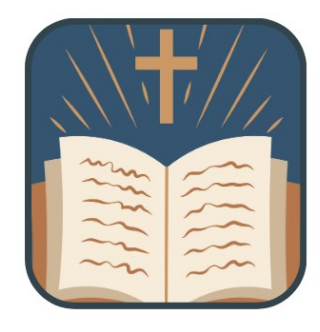
Bible Trivia Twenty Question Trivia January 21